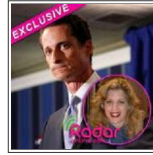
Rep. Weiner's Cyber Sex Chat With Las Vegas Mistress — Word For Word 2 weeks ago Powered by Vertical Acuity