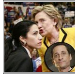
VIDEO: Huma Abedin Knew About Sexting Before Marrying Anthony Weiner 6 days ago