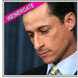
Fully Exposed! Shocking Weiner Photo Revealed 6 days ago